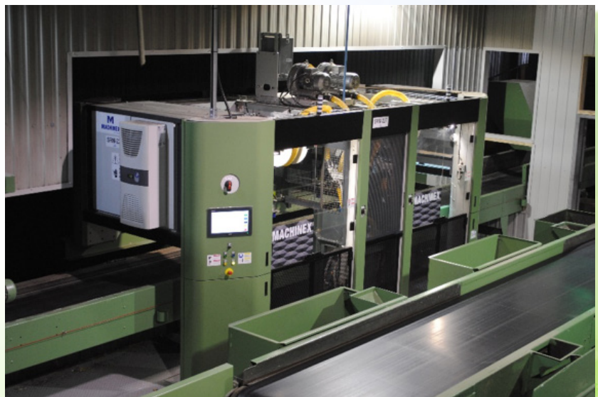
SamurAI robotic unit.